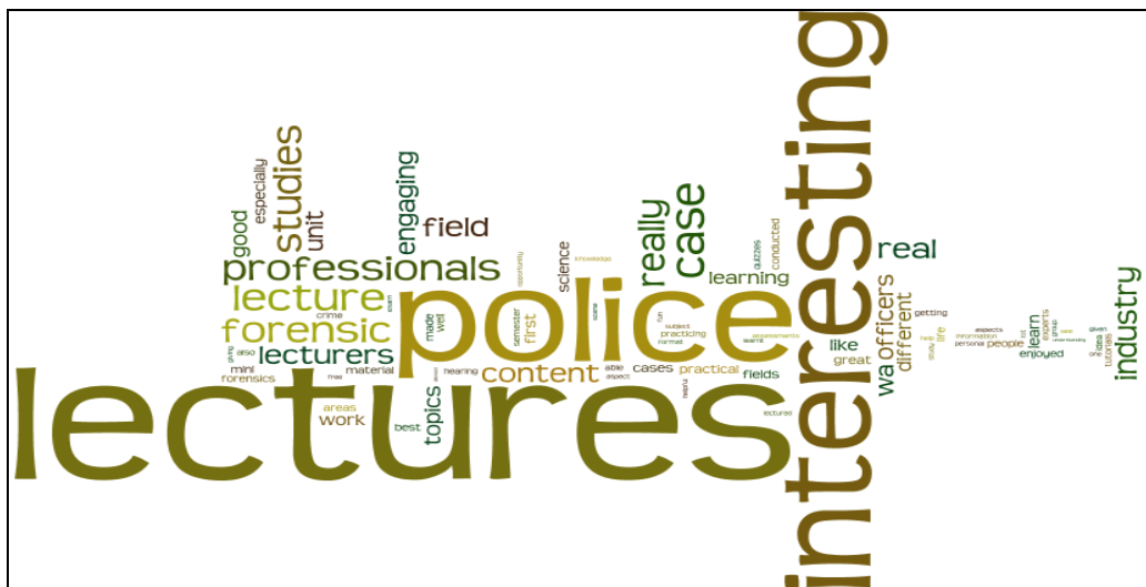
Figure 2: Wordle word cloud indicating the most common terms students used in response to “What were the best aspects of FNSC2200?”

notes be made available to students. In total 83.8% of respondents suggested ‘traditional’ lecture/tutorial format aspects be included in Mysteries of Forensic Science.