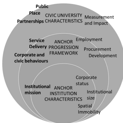
Figure 1: Conceptual framework: UK universities as anchor institutions

The conceptual framework considers how the key characteristics of anchor institutions provide the basis upon which engagement and collaboration can be progressed and what it means for universities as anchors. Figure 1 details these relationships where we consider the concepts as building in specificity from general anchor institution concepts, which apply to all anchor institutions, to how universities can deliver on their promise of becoming truly civic anchor institutions. The concepts in bold are those this project engages with most notably, focusing on the institutional mission of the anchor institution (inner circle); the service delivery and corporate and civic behaviours dimensions of the anchor institution framework (middle circle); and the elements of place, public, and partnership of the ‘civic university’ model (outer circle).