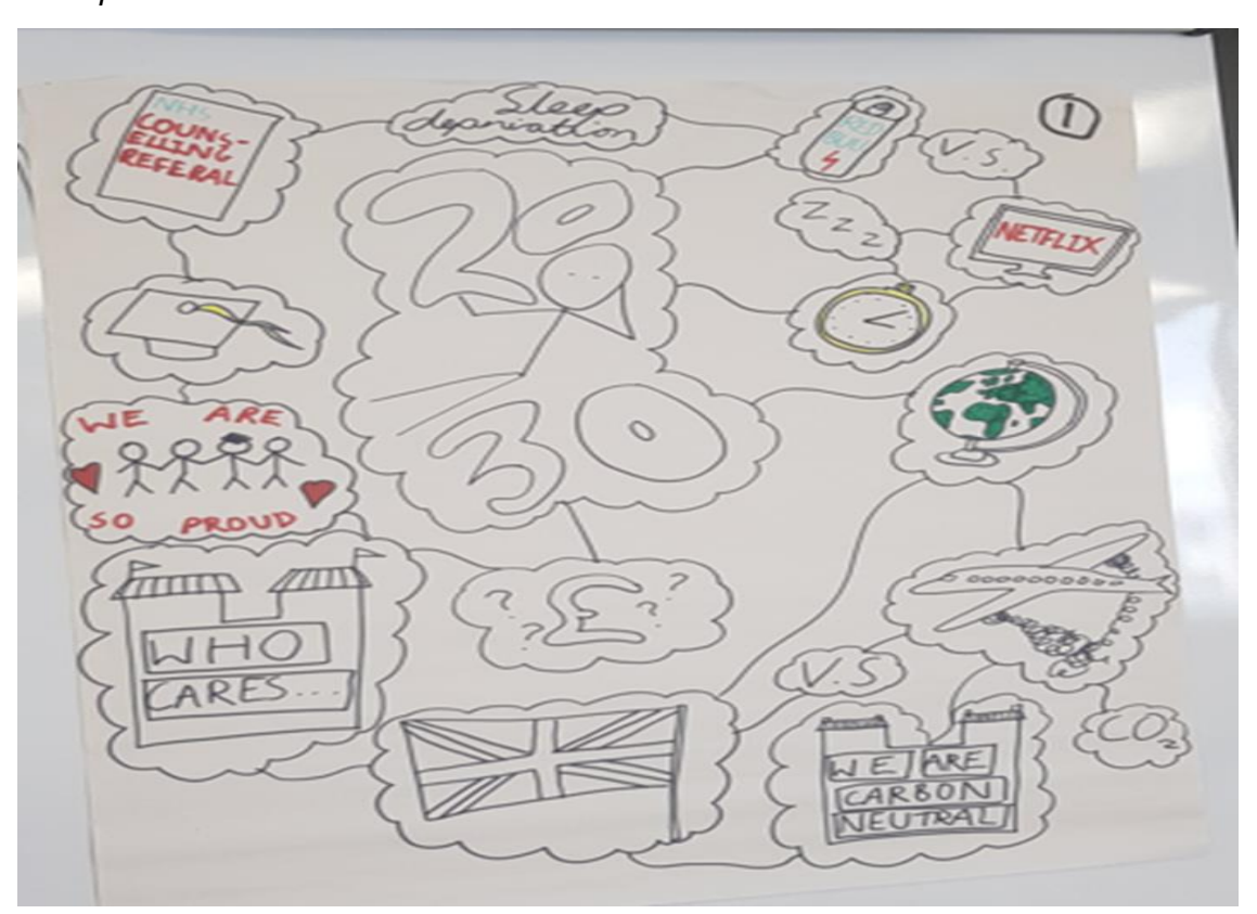
Figure 1 Example of Rich Picture

Additionally, a focus group was undertaken with the Learning Research Technology unit at the University involving highly experienced learning technologists, many of whom had decades of experience in their roles which largely involves developing technological solutions for learners. This focus group explored the technological opportunities and challenges of the proposed scenario. Detailed field notes were taken, and the focus group was recorded and later transcribed.