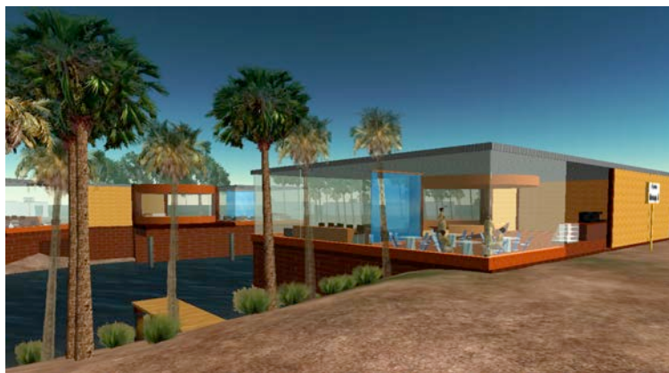
Figure2: YouTopia in Second Life