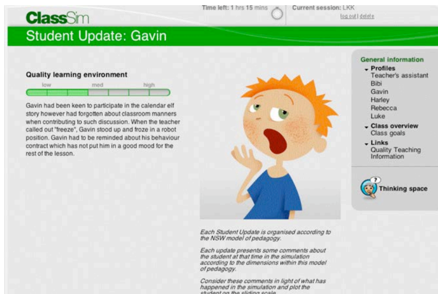
Figure 1: An example of a student update

In the introduction of new teaching and learning experiences the user is able to access ‘teacher thoughts’ pertaining specifically to what is happening in that episode. We believe this provides pre-service teachers with access to detailed commentary from someone on the field. Further, the ability to access commentary provided by an expert for individual targeted children at decisive points in the simulation provides additional access to expert advice. Figure 1 provides an example of such information. The user is able to see a rating of where on the continuum that particular child may be, along with a visual image representing what that child may look like at that time. We spent considerable time developing more than forty facial expressions for individual children within the virtual classroom. As teachers, we were very aware that often the first indication you get as to how engaged a student is, is from looking at their face. With that in mind, the development of a visual representation seemed appropriate to accompany the more descriptive written commentary.