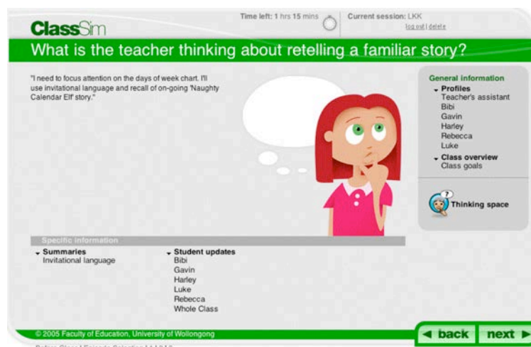
Figure 3: An example of a screen that allows the user to be aware of the teachers' thoughts