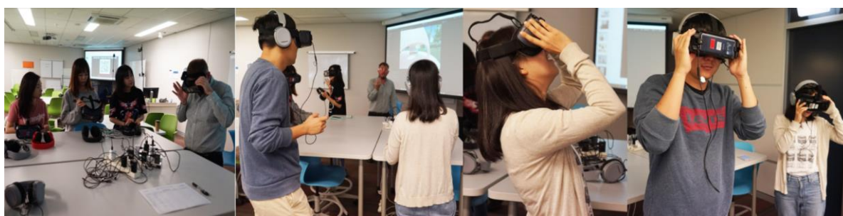
Figure 3: Communicating the virtual built environment hands-on with mobile VR technology