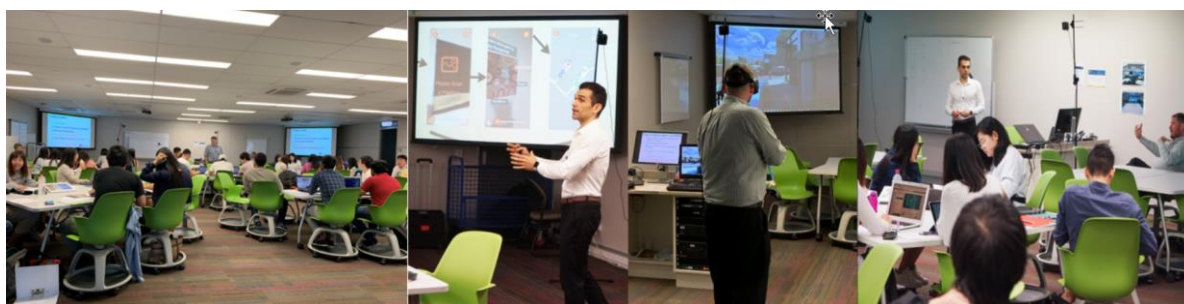
Figure 1: Future of work and impact of AI/VR/AR technology within the construction industry lecture

The specific lesson was run in the first trimester of 2019 at an Australian University and involved 45 postgraduate participants from the construction course SDCM73-100 Professional Portfolio. The subject uses situated learning and encourages students to develop their professional skills in a real-world environment by combining self-analysis and reflective learning skills with professional methodologies, to expand analytic and strategic thinking capabilities as it relates to the construction profession. The students were given a 60-minute lecture (see Figure 1) on the impact of AI, VR and AR technology within the construction industry with a demonstration of HTC VIVE and HoloLens technology as it applies to the construction industry and BIM visualisation. Students were then asked to complete two hands-on learning tasks using mobile AR (see Figure 2) and mobile VR (see Figure 3) by exploring BIM models and real-world locations enhanced with the technology.